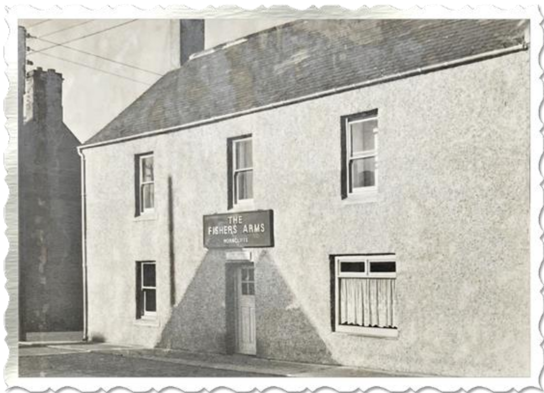
The Fisher Arms Horncliffe Community Pub Ltd, Cairnbank, West End, Horncliffe, Berwick-upon-Tweed, TD15 2XN