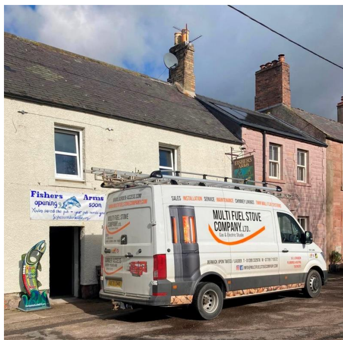
Below: One of many contractors working on the refurbishment

The pub is currently undergoing repairs and refurbishment due to the dilapidated state and should be back open within the next year.