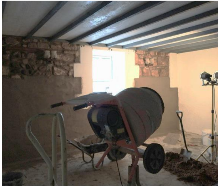
Above: Works to dampproof the interior wall in the lounge area

The Fishers Arms, Main Street, Horncliffe, opened in 1760.